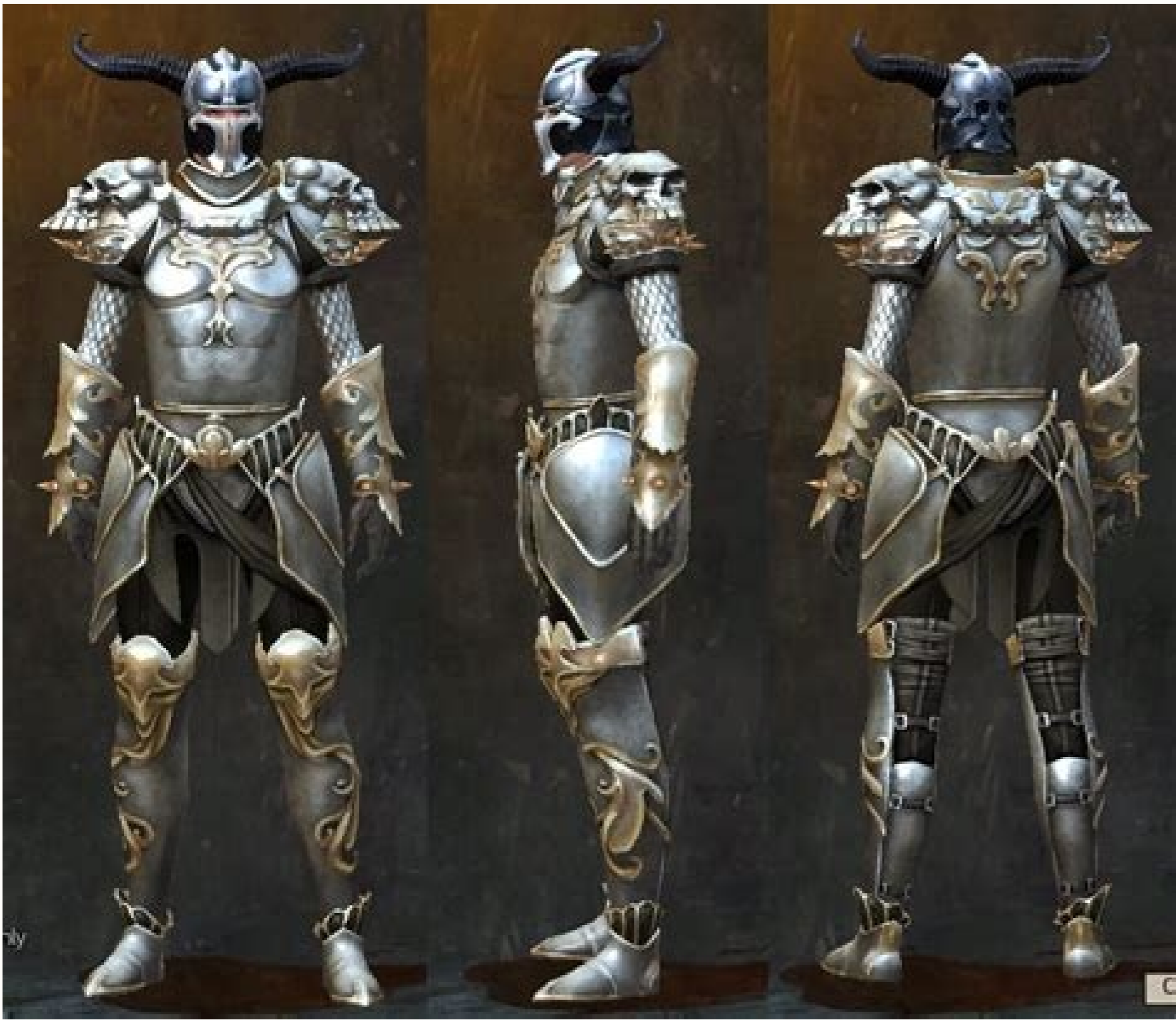
Gw2 armorsmithing guide 400-500.